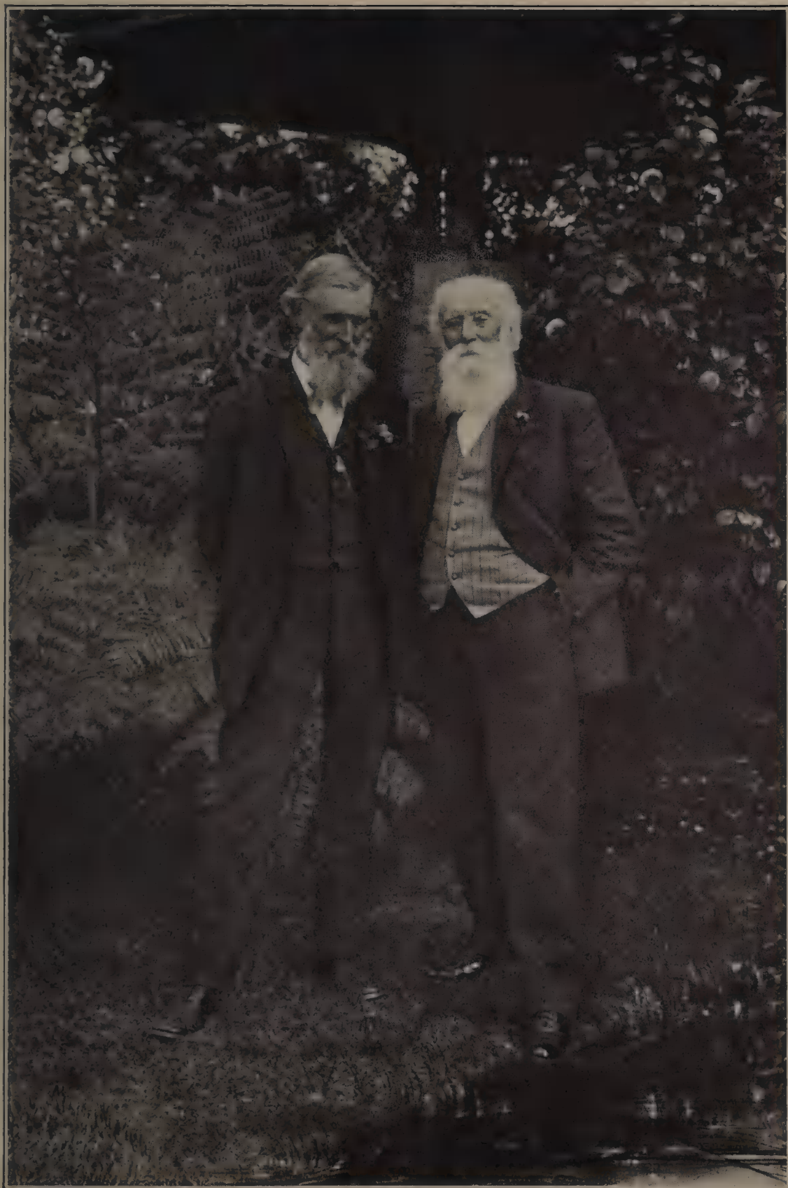
JOHN MUIR AND JOHN BURROUGHS, PASADENA, CALIFORNIA